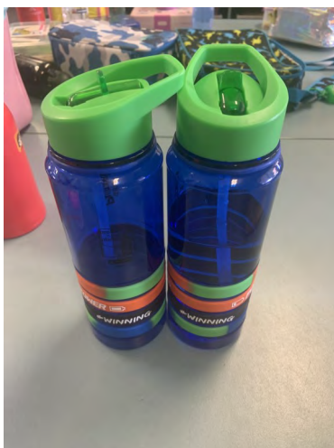
Identical bottles with no names in one of our Kindergarten classes

Please remember to label everything your child brings/wears to school.